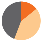
East Asia & Pacific