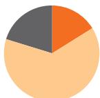
Latin America & Caribbean